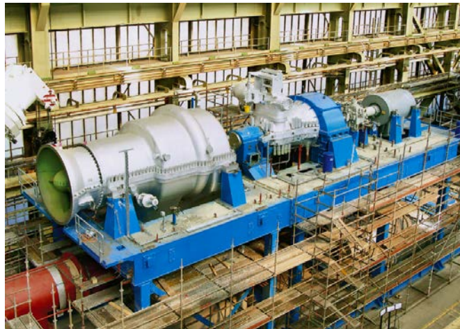
Gas-To-Liquid (GTL) Trains during the testing at Oberhausen, Germany.

The size of these machine trains creates the criticality and complexity in overhauling and refurbishing its components within the stipulated shut down and overhaul periods, which is exactly where GTS comes into play. With the help of highly trained local professionals and thorough quality control processes GTS is well placed to conduct the majority of these required works right here in Qatar.