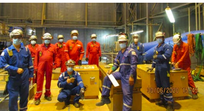
GTS Team with the customer's turnaround team after successfully completing an emergency shutdown work.

In 2020, GTS successfully delivered two minor emergency shutdowns on the main air compressors of two of these GTL trains at one of our customer sites. Deploying more than 20 personnel in less than a week, GTS was able to plan the overhauling schedule and execute the jobs within the stipulated time frames. In addition to the GTS teams deployed to site, workshop teams were also supporting the urgent requirements during this shutdown period. Due to the COVID-19 situation, manpower mobilization schedules had to be carefully designed and the respective teams were accommodated in isolation to address various in-house as well as customer specific safety protocols amidst officially imposed local restrictions during that time.